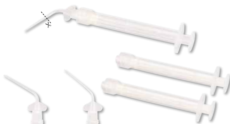
Miraject Flexi Tip 21G ø 0.6 – 0.8 mm x 24 mm Miraject Flexi Tip 27G ø 0.2 – 0.4 mm x 20 mm